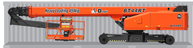
Standard Container Transport