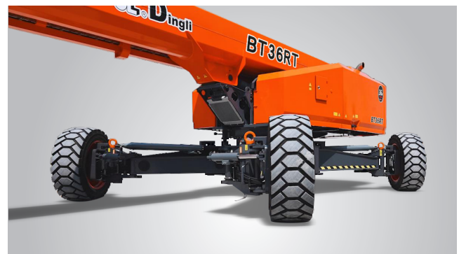
Brand New One-Key In-Situ Axle Expansion Technology Global Patent Protection