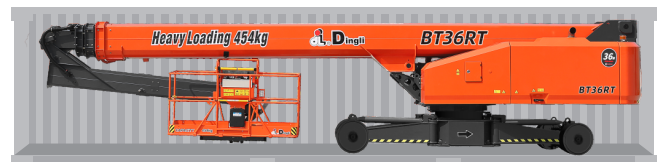
Standard Container Transport