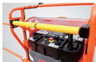
Anti Extrusion Device