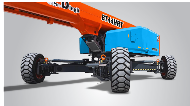
Brand New One-Key In-Situ Axle Expansion Technology Global Patent Protection