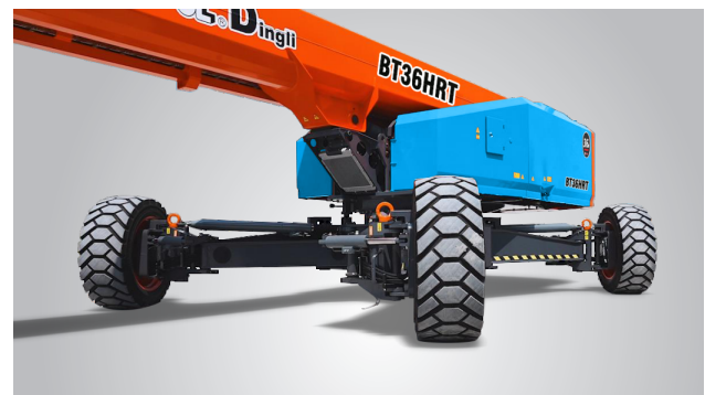
Brand New One-Key In-Situ Axle Expansion Technology Global Patent Protection